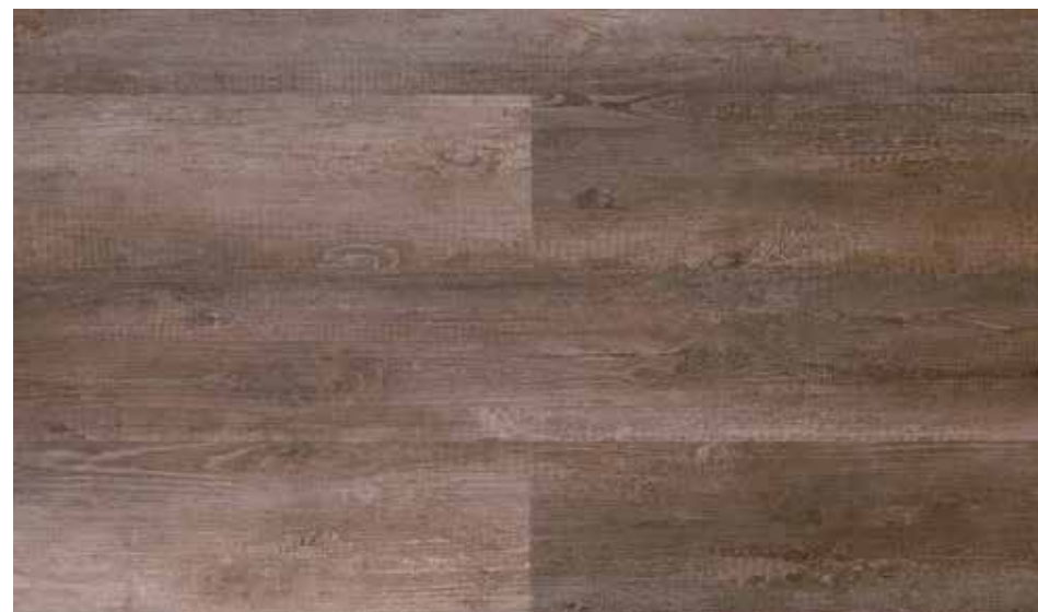
DP1318 OUTBACK STATION