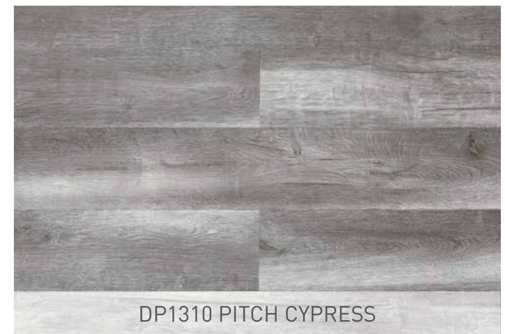
DP1310 PITCH CYPRESS