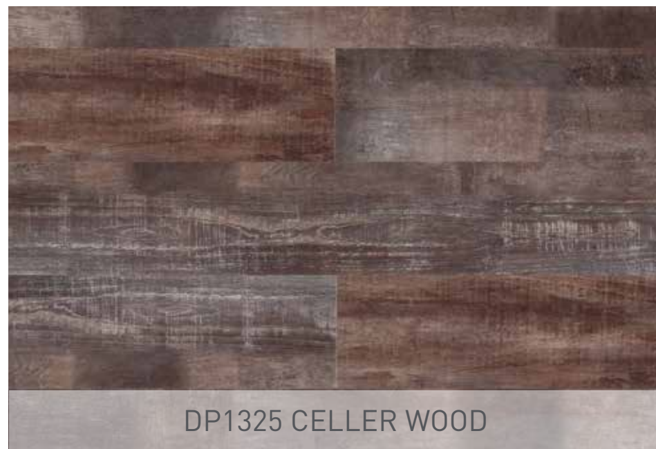
DP1325 CELLER WOOD