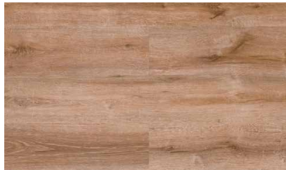
DP1312 ROYAL OAK