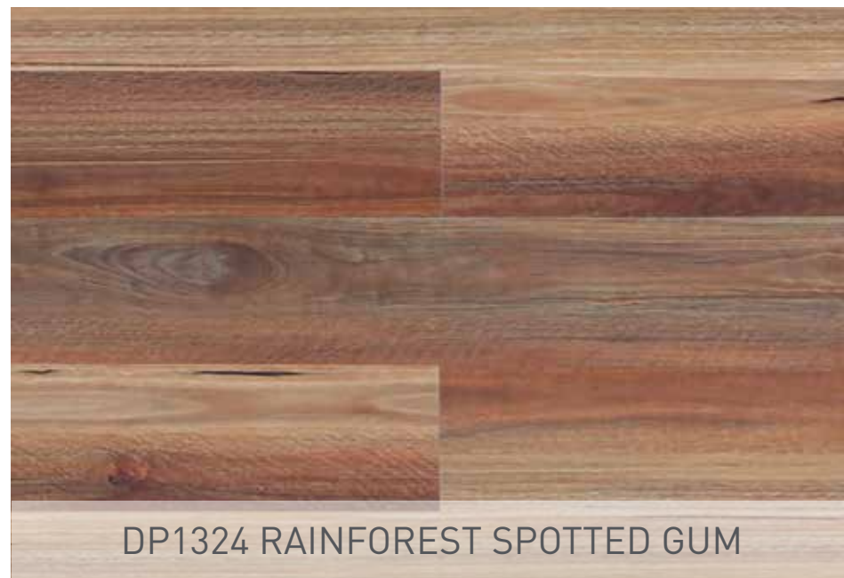
DP1324 RAINFOREST SPOTTED GUM