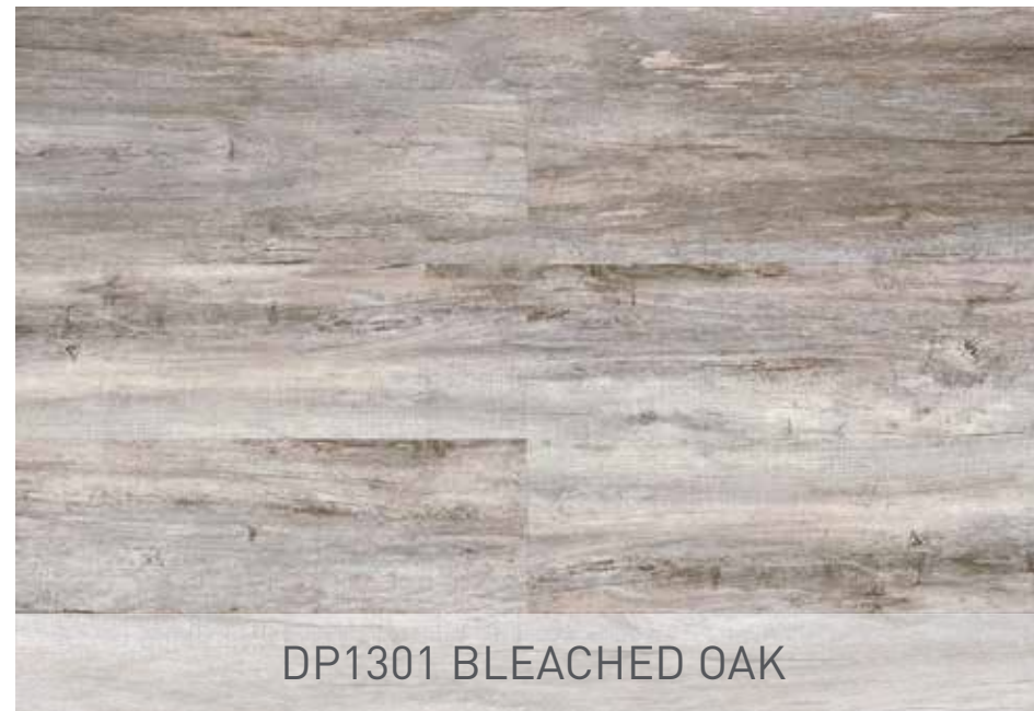
DP1301 BLEACHED OAK

With a wide colour selection from the warm tones of native Australian timbers such as Western Spotted Gum, to the cool hues of Bleached Oak. There is sure to be a colour to suit all decors.