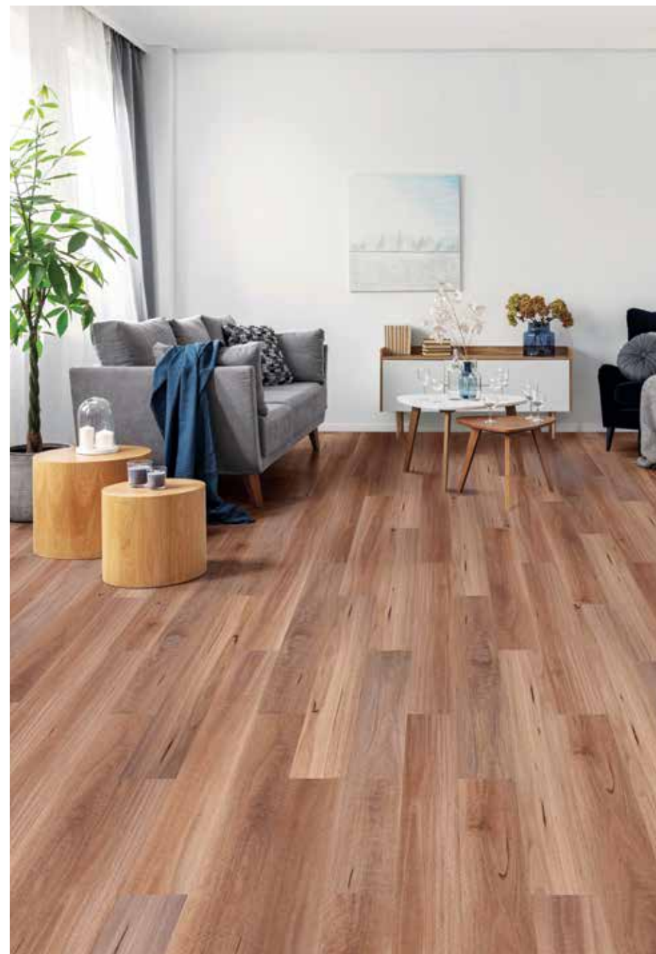
DP1326 WESTERN SPOTTED GUM