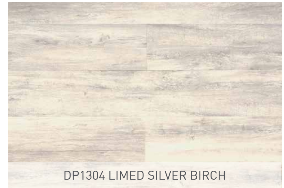
DP1304 LIMED SILVER BIRCH