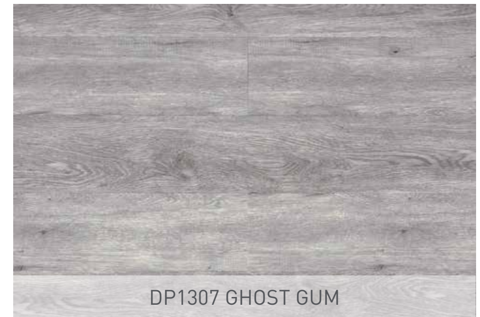
DP1307 GHOST GUM