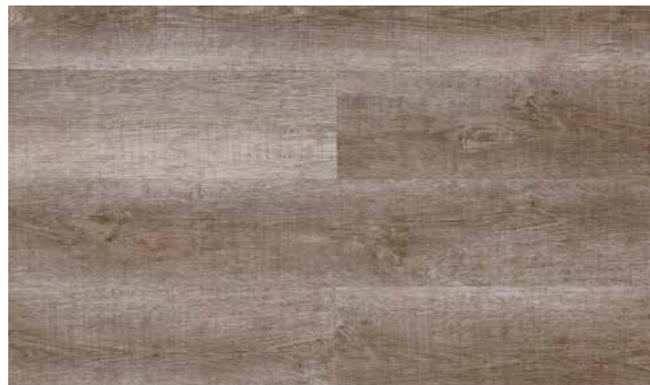
DP1315 TAUPE OAK