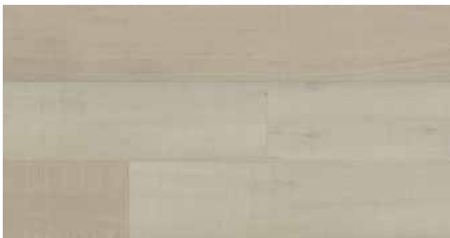
Lucky Pearl SCB5513