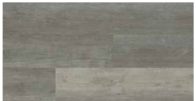
Eagle's Nest SCB5523