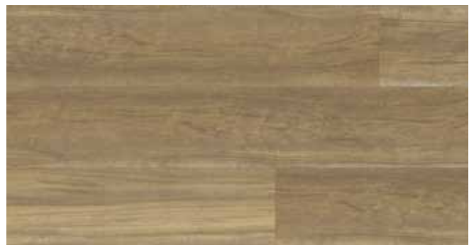
Wagon Wheel SCB5522