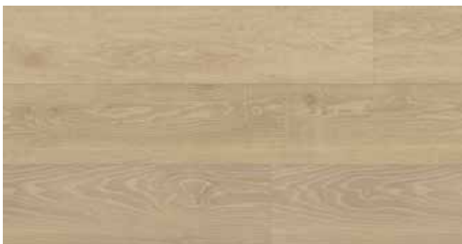
Sunken Treasure SCB5514