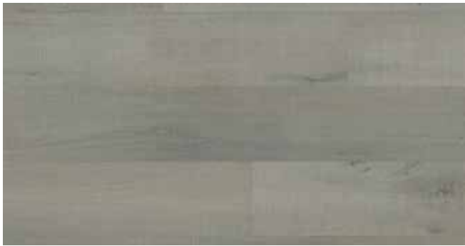
Ancient Scroll SCB5512