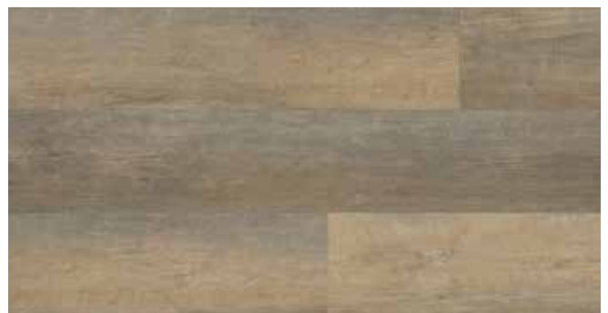
Vintage Hall SCB5524