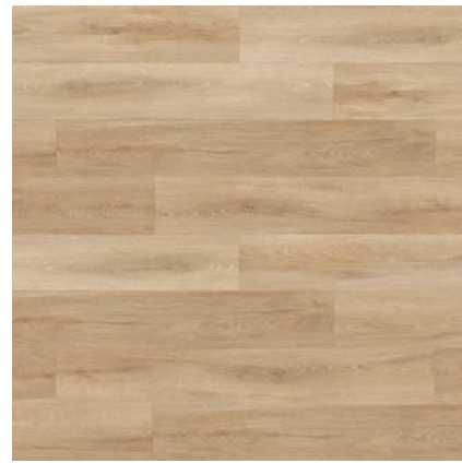
APX11455 Bohemian Oak