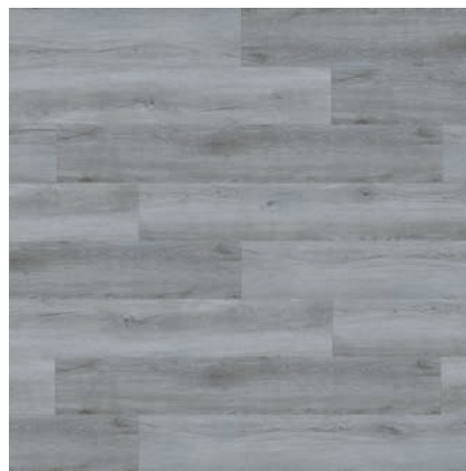
APX11457 Raven Oak