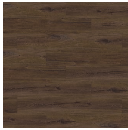
APX11450 Mocca Oak