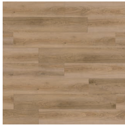
APX11453 Feature Oak