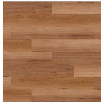
APX11452 Queensland Spotted Gum