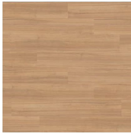
APX11454 Australian Brushbox