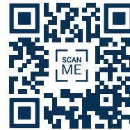
STYLE GUIDE LOOKBOOK