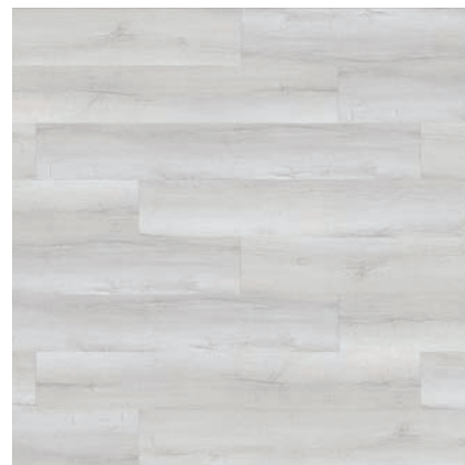
APX11458 Cracked Oak