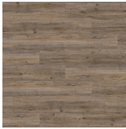
APX11451 West End Oak