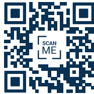
INSTALLATION & MAINTENANCE GUIDE