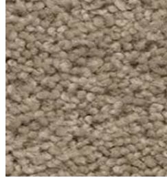
550 Vintage Stone