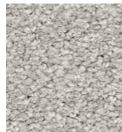
715 Grey Haze